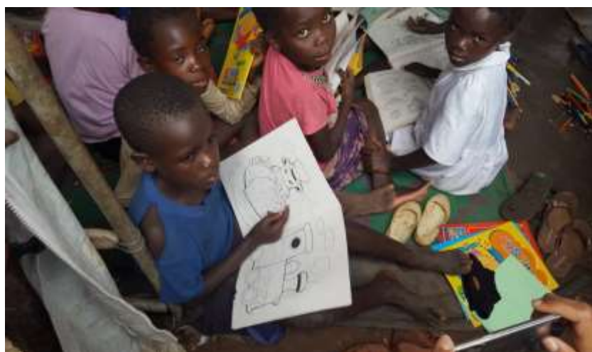
Children learning at a Child Friendly Centre in Kenani Transit Centre